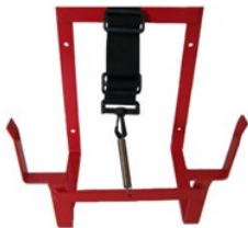
Optional Heavy Duty Vehicle Mounting Bracket

The BPFF 16L firefighting backpack was specifically developed in conjunction with and for use by Australian Rural Firefighting agencies. The popular, portable and robust backpack sprayer has been adopted by many other government agencies, mining companies, forestry operations, farming businesses and individual land holders as a practical rural fire fighting solution. Regularly carried in rural vehicles using the optional heavy duty vehicle bracket (#HDVBRK) the backpack sprayer is easily transported to remote locations using the incorporated backpack harness. The hand operated slide pump is both adjustable and easy to operate. The BPFF is ideal for mopping-up operations, small spot fires and for combating isolated or small ember attacks.