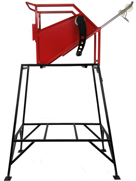
FHER ROLLER & FHRS STAND SOLD SEPARATELY