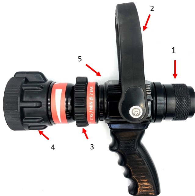
INSERT 1 (FRONT)