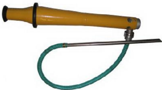
Model Pictured: FB225HU

If required other adaptors may be selected and an on/off ball valve may be specified as an optional extra on the /H models.